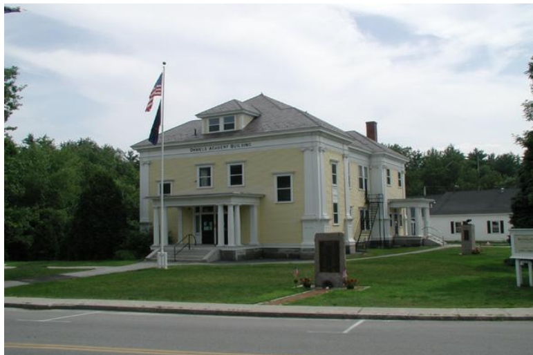
Brookline, NH – Town Hall (Daniels Academy Building)