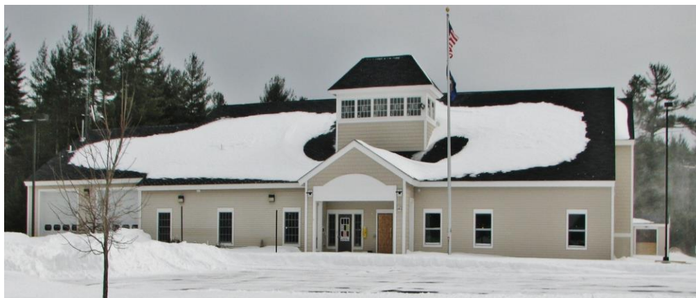
Brookline Safety Complex – Ambulance Service & Police Department

For more information, non-emergency services and staff roster, including email addresses, please visit our website: www.brookline.nh.us/ambulance-service