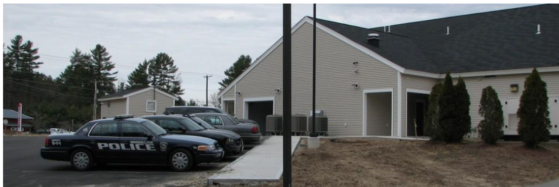
Brookline Safety Complex – Ambulance Service & Police Department