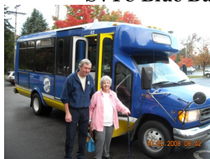
SVTC Blue Bus

Call Nashua Transit at 603-880-0100 in advance to schedule door to door transportation to your medical or social services appointment on Tuesday, Wednesday or Thursday or to shopping on Thursday. $2 each way.